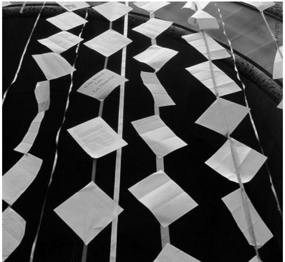
Grantee Milk Not Jails in New York organized an action where they "hung letters from hundreds of people in prison about their repeated parole denial" in the New York State Capitol building.